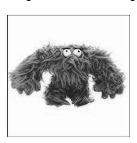
Figure is about 6 inches long and the Hungry Magnets is about 4 inches long. This product was sold exclusively by Weight Watchers between April 2009 and July 2009 for between $4 and $7.

BRAND/MODEL: The Hungry Figures and Hungry Magnets have orange plush exteriors. The Hungry