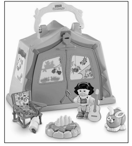
figure. Only Sonya Lee figures that bend at the waist, have a green sweater and purple camera around the

neck are included in this recall. No other Sonya Lee figure is affected. The remaining pieces of the Little People Play 'n Go Campsite are not affected. This product was sold at major retailers including mass merchandisers, discount stores, department stores and toy stores nationwide and in Puerto