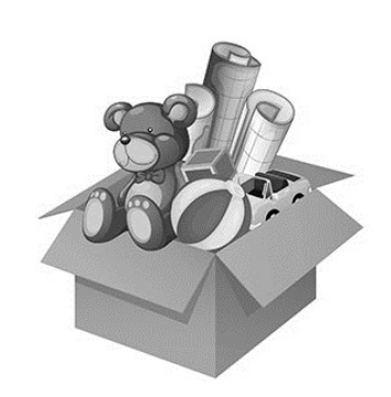
The Safety Box Spring/Summer 2015

Louisiana Attorney General's Office Public Protection Division Consumer Protection Section P.O. Box 94005 Baton Rouge, LA 70804-9005